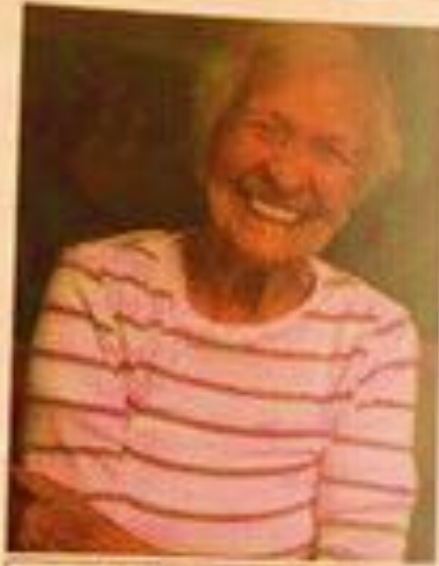
OUR 100TH BIRTHDAY GIRL