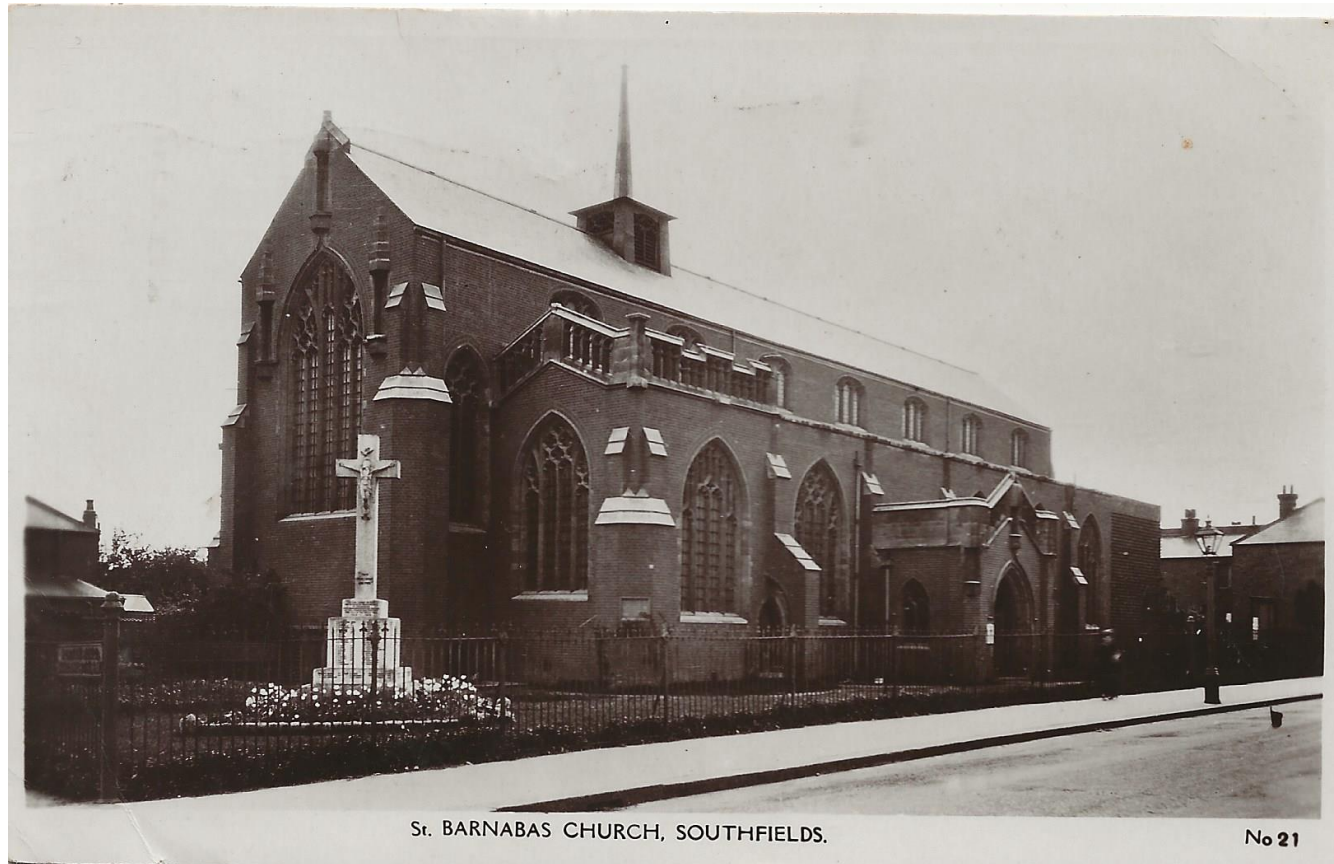
St. BARNABAS CHURCH, SOUTHFIELDS.