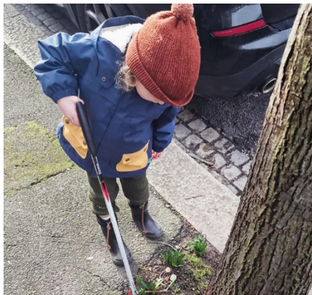
KEEN YOUNG LITTER PICKER

Southfields resident Suzy Levy was becoming annoyed by the growing volume of rubbish on some local streets. "Litter can become a bit like wallpaper" she outlined. "If you walk by it too many times you begin not to see it anymore. I felt like our neighbourhood was getting to the wallpaper phase, where rubbish was just 'expected.' It frustrated me." So after a post on social media, she and dozens of residents banded together to start the 'KeepWimbledonParkTidy' group and completed a first community litter pick in late January.