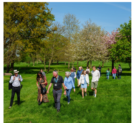
WALKING THE EX-COURSE

Also, on Saturday and Sunday 23rd /24th March the AELTC hosts its first Nature Weekend of 2024, with two more following in September and November. With the return of spring the Nature Weekend focuses on the importance of water to nature. Everyone can come and learn more about that issue, the