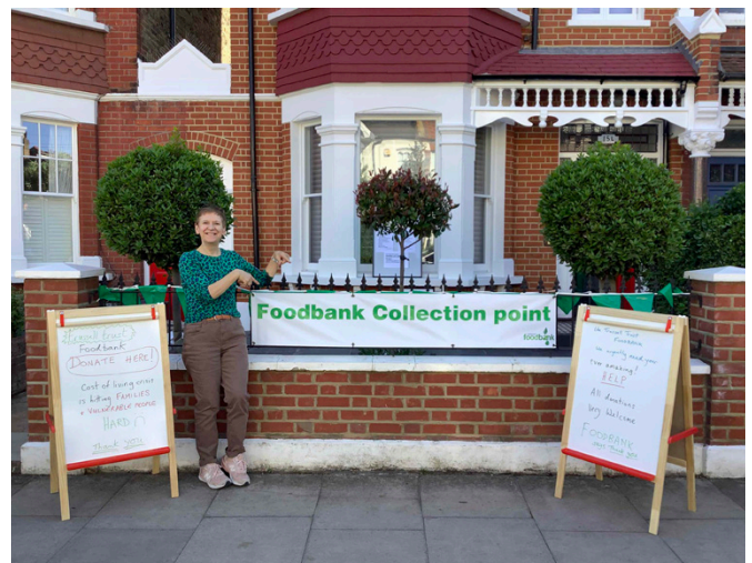
DIANA'S FOOD BANK IS UNMISSABLE

Find out more about making a financial donation to Wandsworth Foodbank at https://wandsworth.foodbank.org.uk