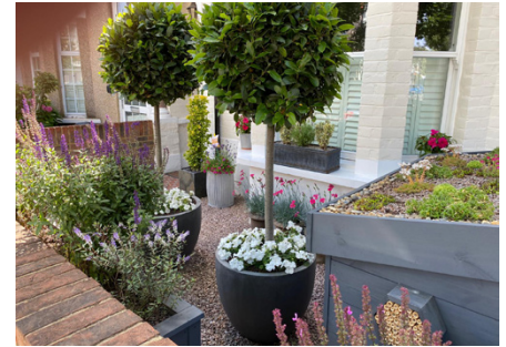
2022 FRONT GARDEN WINNER

Judging will take place from Friday 21st - Sunday 30th June. No-one needs to sign