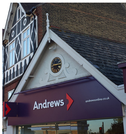
OUR GRID CLOCK