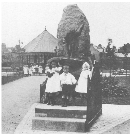
THE FOUNTAIN IN 1904

One of the long-term aims of the Friends of Coronation Gardens has been the restoration of the original 1904 Edwardian water fountain back to full working order, which would be a source of drinking water for visitors. It's been in a sad state for decades, especially after the bronze 'Aquarius' figurine at the front and the rear plinth were removed, presumed stolen.