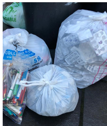
RMS ARE AFTER THIS LOT!

Our Facebook and Instagram pages @ recyclemore_southfields have regular updates and tips on how to reduce waste and recycle more. Also, don't forget to read and keep handy the flyer that comes with this issue of 'Grid News.'