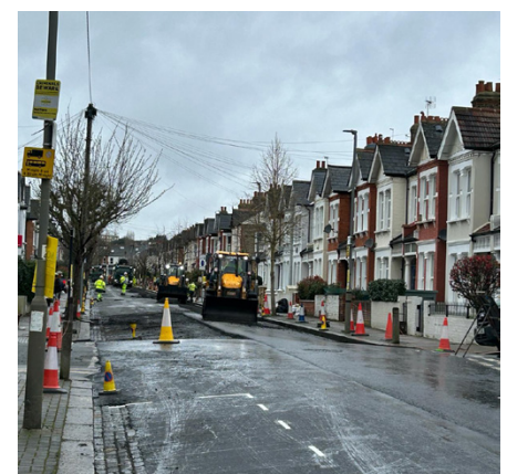
BRAND NEW LAVENHAM

Road now rebranded Cloudtech. The site on Replingham Road, once a laundrette not so long ago and then Douglas & Gordon estate agents, has reopened as Carter Jonas estate agents.