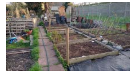
THE FUTURE OF THESE SOUTHFIELDS ALLOTMENTS IS STILL IN DOUBT

Turning to the shops themselves, although there are still some vacant shop frontages the premises vacated by Barclays and Haarts are showing signs of refurbishment, and the London Nail Club has opened. It's believed that the shop that was Starbucks