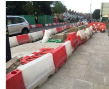
NO MORE SLIPPY GRID PAVEMENTS, ESPECIALLY OUTSIDE MARKS & SPENCER

pavements in Southfields can be very slippy when wet. I discussed it with the relevant Council department. They say the paving used on Replingham Road, for example, is a typical highway product, but they called the supplier Marshalls out to test it".