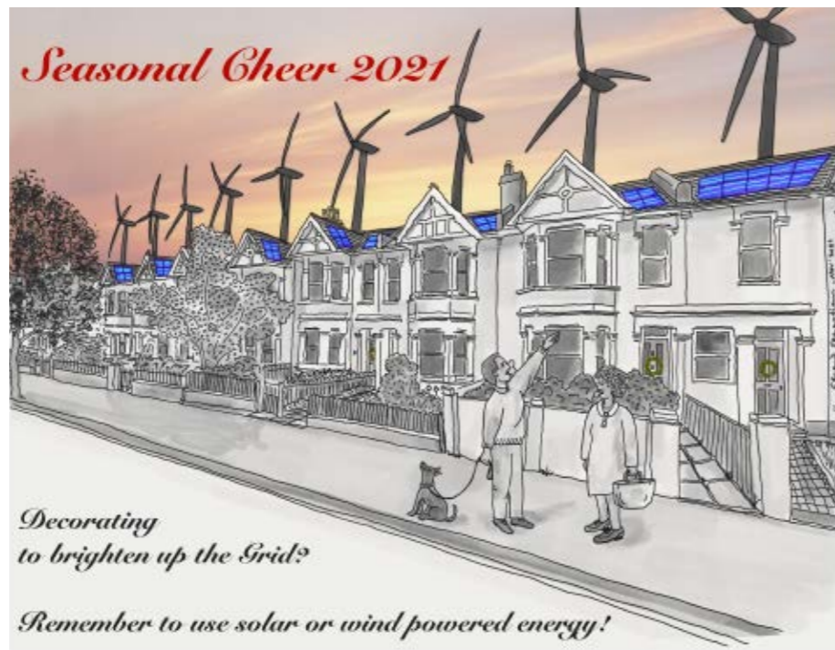
CARTOON BY GERARD