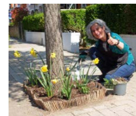
HAPPINESS IS A LOVINGLY-TENDED TREE BASE, SAYS THIS RESIDENT

Food and Wine shop on Revelstoke Road. At Southfields Harvest we also gave out over 1,000 mini daffodil bulbs to Grid residents. We look forward to seeing them blooming in the spring. Meanwhile, outside the Grid we were pleased to take part in the first Putney Clean Air Fair hosted by our local MP Fleur Anderson, where there was much interest in our project. We took part in Wandsworth's Together on Climate Change Festival at