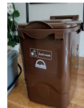
NEW RECYCLING BINS DELIVERED TO GRID HOUSES

If you have any questions at this stage please get in touch with me and the team at foodwasterecycling@wandsworth.gov.uk.