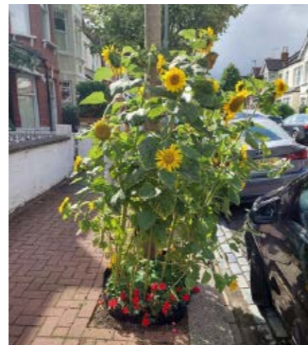
CLONMORE STREET WINNER, IN A TREE BASE