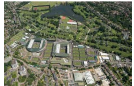
WHAT WILL THIS LOOK LIKE IN 2030?

You can read more about the AELTC's proposal at www.wimbledon.com/wpp