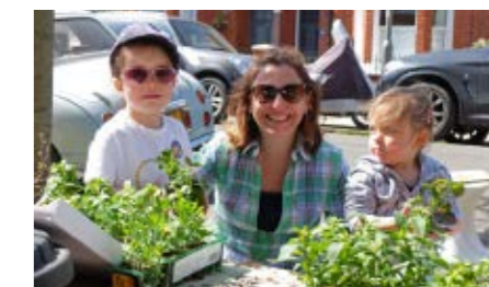
TWO YOUNG GARDENERS AND THEIR MUM READY FOR PLANTING ACTION

You can reach us at www.frontgardenfriendly.uk