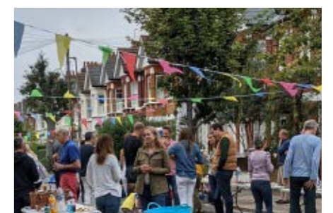
THE ENGADINE STREET PARTY IN FULL SWING

Editor's note - the SGRA have approached our councillors to find out if the council plan to waive their £60 licence to close a section of the Grid to hold a Jubilee street party, as they did in 2012.