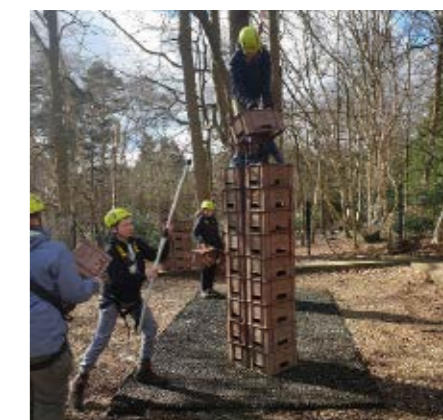
OUR SCOUTS ENJOYED 'CRATE STACKING' AT THEIR WALTON FIRS SUMMER CAMPSITE

after joining as a Young Leader, or in any capacity at 8th Wandsworth, you quickly begin to become part of a family you will never want to leave". To arrange an informal chat please contact info@8thwandsworth.org.uk or visit www.8thwandsworth.org.uk We can't wait to hear from you.