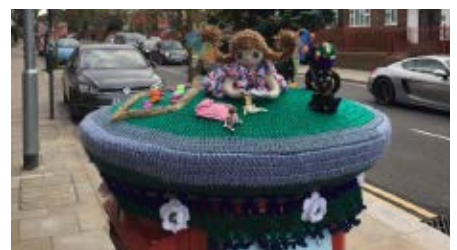
OUR COLOURFUL POST BOX TOPPER

people all just wanting to spread a smile to everyone". To the mystery local who knitted our letterbox - "top bombing!".