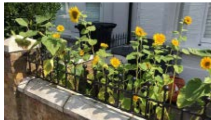
ASTONVILLE STREET WINNER, IN A GARDEN

of the sun. Very well done to all our SGRA Award winners, and a big thank you to all of you who grew sunflowers. You did the Grid proud! We are hoping for do another round of Spectacular Sunflowers next year, so do look out for the Green the Grid sunflowers seed giveaway next spring. Here are some entries that we gave awards to: