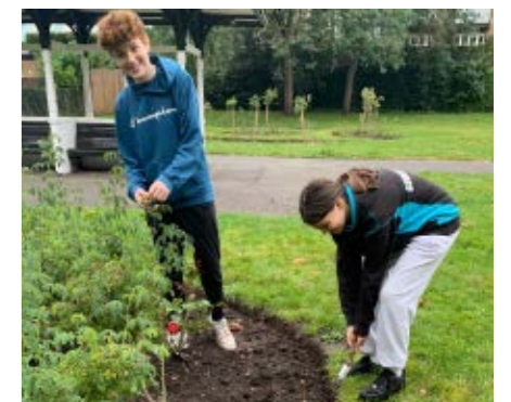
TWO OF THE DUKE OF EDINBURGH AWARDS STUDENTS HARD AT WORK