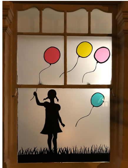
ONE OF LAST YEAR'S DISPLAYS