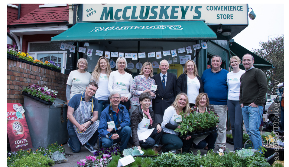
JUSTINE GREENING MP JOINS IN PLANTING DAY