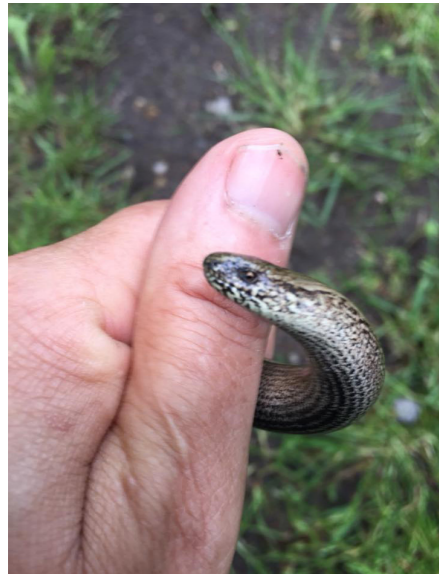
SLOW-WORM DISCOVERED IN WIMBLEDON PARK

It's not a snake and it's not a worm! It's actually a legless lizard, known as a slow-worm. Discovered by the edge of the lake in Wimbledon Park, it is believed to be the first reptile recorded to be found in a Heritage Park (although we hear some locals have found them in their gardens).