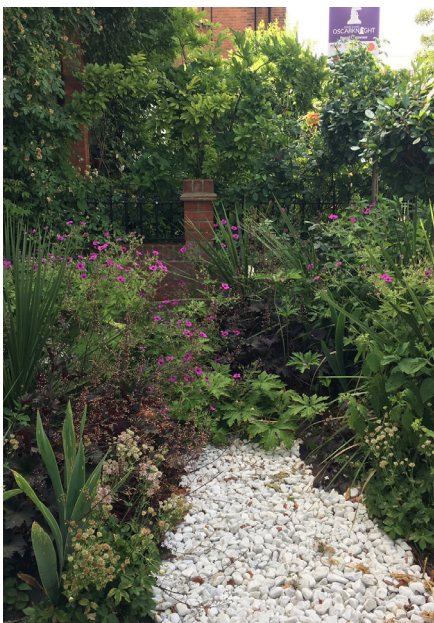
FRONT GARDEN WINNER

Following the hugely successful Green the Grid day on 9th June (see page 5), the judges changed course in the Guerrilla Garden category. They saw so many lovely tree base flower displays, that instead of choosing an overall winner, they have identified one Guerrilla Garden per street and will be handing out flower prizes to each one - 12 in total.