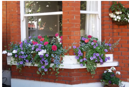
WINDOW BOXES & POTS WINNER