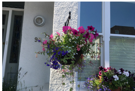
HANGING BASKETS WINNER