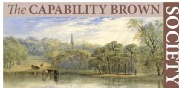
'Capability Brown's Wimbledon Park' 19th Century Water Colour Circa 1870 by an Unknown Artist