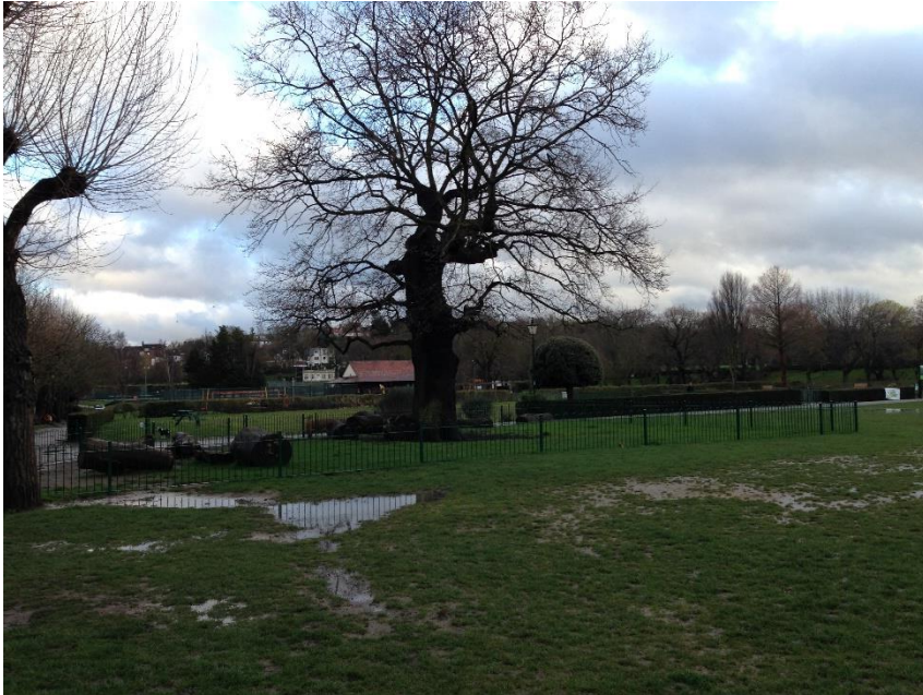
Veteran English Oak 1780